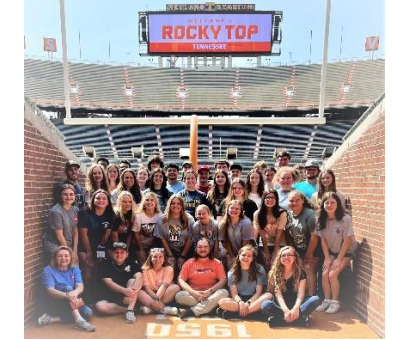
Tour of Neyland Stadium & Locker Room Vet Science working goats